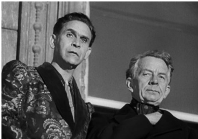
Ernst Deutsch and Erich Ponto in The Third Man

heartily jovial, sugarcoated Viennese horrors had all crawled out.