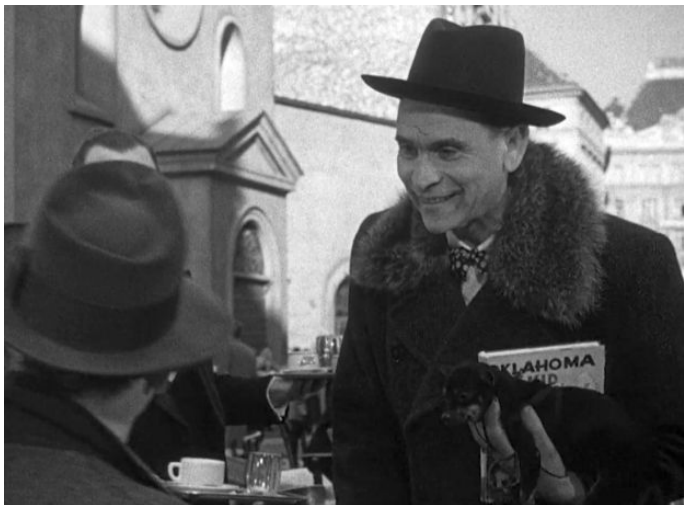
Ernst Deutsch in The Third Man (screenshot)

An examination of two of these émigrés – Fritz Kortner and Ernst Deutsch, major Central European actors, very well known in their home countries before leaving them in duress,