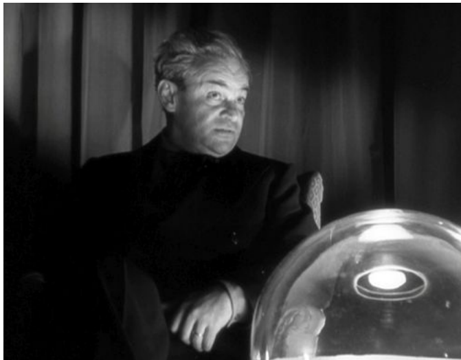
Fritz Kortner in Somewhere in the Night (screenshot)

shoulders, their chin or the raising of an eyebrow. This is what Kortner could do – express something that was both menacing and endearing, a charming ambiguity, a latent aggression and at the same time a warmth; he was always more than the role, far more than the cipher, the mere stick-figure he'd been allotted.