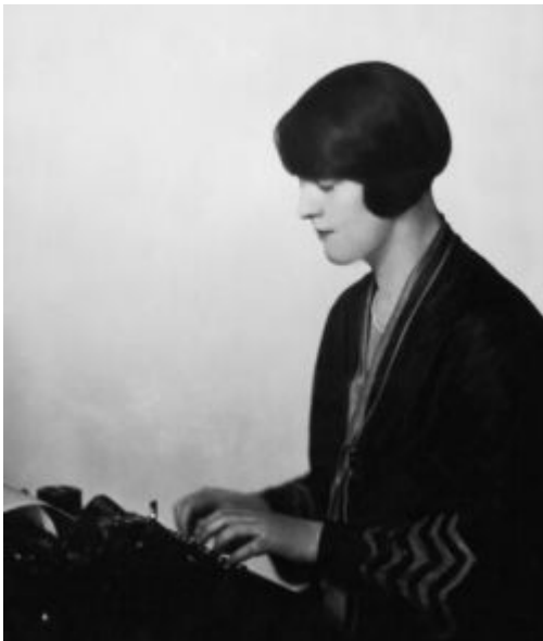
Dorothy Thompson in 1920.

circumstances, the actor soon grew despondent of his future. So it was only a matter of time and logic before he would be going to America. With the aid and encouragement of the dedicated anti-Nazi journalist Dorothy Thompson and her husband Sinclair Lewis, Kortner set sail for America. Although his eventual destination was Hollywood, his first stop was New York. Both famous writers met Kortner with open arms at the docks upon his