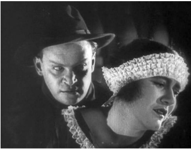
Fritz Kortner in The Hands of Orlac (screenshot)