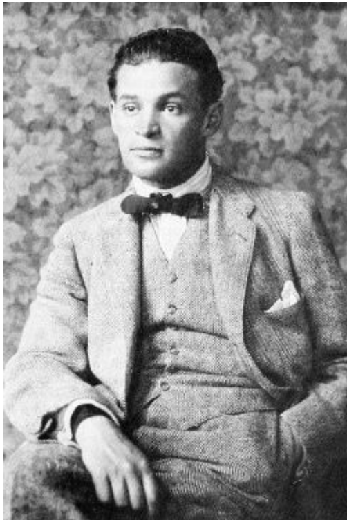
Fritz Kortner in 1911.

From his earliest years, Fritz Kortner (1894–1970), born in Vienna, was