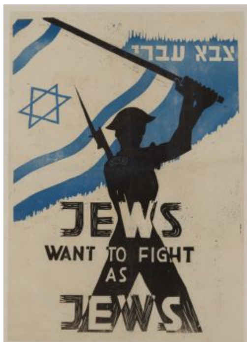
Recruitment poster for the Jewish Brigade of the British Army, circa 1939-40

hundred thousand Jews fought in the Red Army against Hitler, 200,000 of them dying on the battlefields; 550,000 American Jews fought among U.S. forces; 100,000 were in the Polish army; 30,000 in the British army, including the Jewish Brigade, who had been recruited from Mandate Palestine during the war; that’s not to speak of the partisan armies battling in Eastern Europe, which