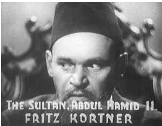
Kortner in Abdul the Damned (screenshot)

characterizations). Dreyfus is shown as just a normal man, somebody who loves and misses his family, who had served in the French army honorably. The actor does not play the part of a “great personality,” as somebody who has to live up to being a political rallying cry for and against everything that people then saw in him. France is a country to which he remains loyal despite the false accusations. One might mention that Heinrich George, of all people, played Emile Zola in the film. George later became one of the most prominent and honored actors in Nazi Germany, also incidentally having a huge role as Karl Alexander, the Duke of Württemberg, in Veit Harlan’s anti-Semitic agitprop film Jud Süß (1940). The role of Dreyfus’ accuser Esterhazy is acted by none other than Oskar Homolka, another future émigré to Hollywood.