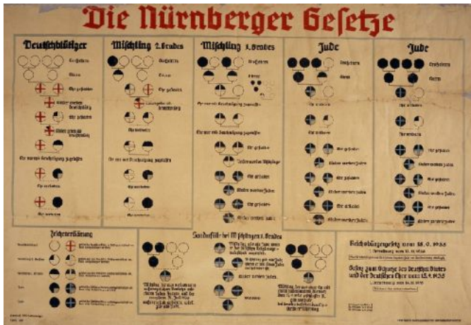
Nazi chart (1935) shows racial classifications under the Nuremberg Laws: German, Mischlinge (mixed blood), and Jew.

Brook is not alone in this unfortunate fantasy of an alignment of Jews with death and darkness. In many European bookshops, the scholarly literature on the Holocaust, even on Nazism itself, is exclusively shelved in the Judaica section.