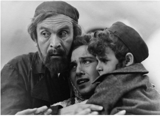
Ernst Deutsch in The Trial