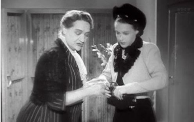
Hedwig Bleibtreu and Ilse Werner in Wunschkonzert (1940) (screenshot)

Office and allowed to finish. The whiff of scandal lingered.