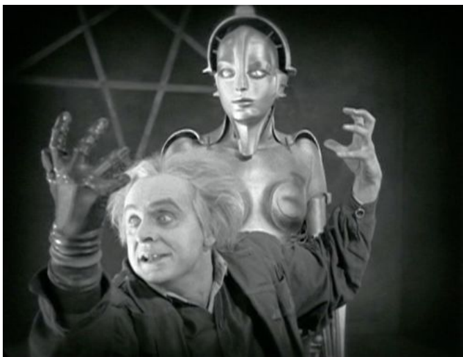
Rudolf Klein-Rogge as Rotwang in Fritz Lang’s Metropolis (screenshot)