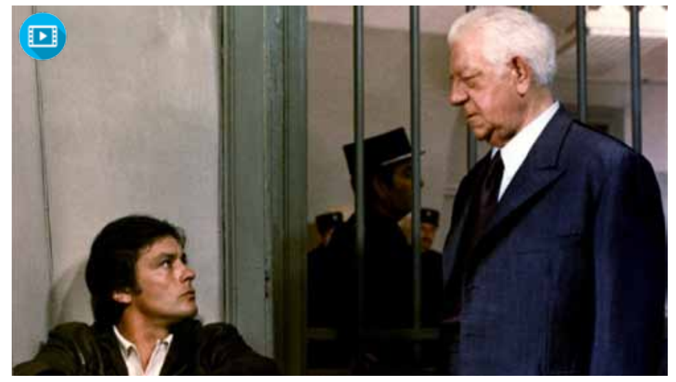
The New France and the Old France, represented by Alain Delon and Jean Gabin in Two Men in Town

As the festival program guide points out,