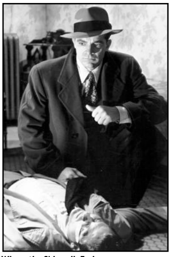
Where the Sidewalk Ends

Asked by Bogdanovich if she remembered any specific direction from Preminger during the filming of Bunny Lake (1965), actress Carol Lynley recalled being nervous