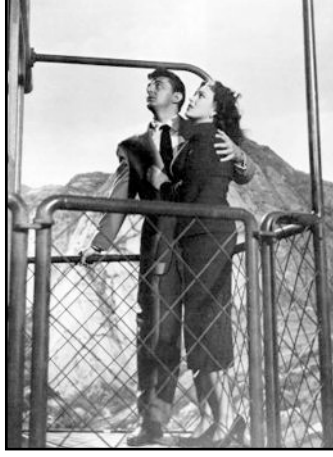
Mitchum and Darnell dangle in the 3-D melodrama Second Chance

The 3-D classic films shown during the festival were all 35 mm prints screened using the 'double interlock' Polaroid system. This system uses two cameras filming lefteye and right-eye images that are projected using two polarized filtered projectors that operate in synchronization. When the images are projected on a screen that maintains the polarization, 3-D glasses permit each eye to perceive the correct image. This system was used to theatrically screen the classic 3-D films during initial release back in the early 1950's and is vastly superior to the anaglyph method that uses red and blue glasses to view like-colored images.